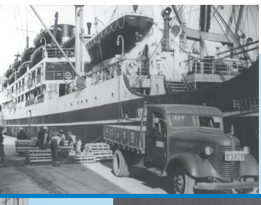
1950s EXPORT CHAMPION commercializes strong, lightweight

The incipient Internet of things (IoT) represents further opportunity. All of the everyday objects communicating and interacting with one another need a power source, and control circuit manufacturers are drawn to EnerCera's combination of small size and high power. Oshima is bullish. "Think of the smartphone," he says. "As soon as it came out, completely unforeseen new applications began springing up like mushrooms