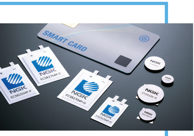
NGK's award-winning EnerCera ceramic batteries are small enough to fit into innovative IoT devices.

buildings and communication facilities. These have the advantage of being safer and more secure than their lithium ion equivalents. NGK's products are even helping to improve the productivity