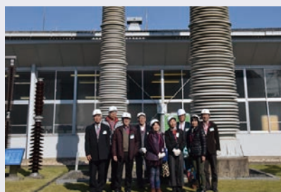
A commemorative photo taken in front of one of the world's largest insulating tubes