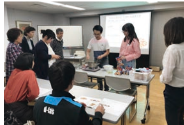
Korean cultural exchange event (October 2017)