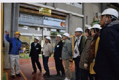
Participants listen to an explanation of the beryllium-copper manufacturing process

These tours help local residents better understand NGK's production and business activities.