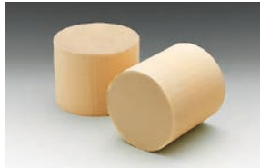
Gasoline particulate filters (GPFs)