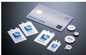
EnerCera® lithium-ion rechargeable batteries