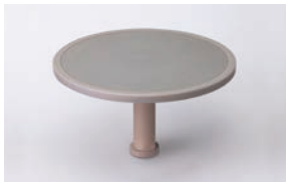
Ceramics for semiconductor manufacturing equipment