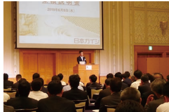
Suppliers invited to the earnings presentation

In the meeting, the director in charge of purchasing first expressed gratitude for the daily transactions. This was followed by the Finance & Accounting Department's briefing on NGK's business results and an explanation by the Purchasing Department about efforts to tackle issues such as continuous communication.